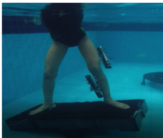
Fig. 2. Balance training and weight bearing using the physical properties of water.

Buoyance compensates for the EF weight, improves muscle activation, and allows weight bearing (Fig. 2) at the beginning of the limb lengthening and/or correction process even in case of weight-bearing restrictions on the ground. With water up to the nipple line, which equates to 35 % weight bearing, patients can use water buoyancy to protect their tissues against gravity, decrease compressive forces for ambulation, and improve cardiovascular conditioning. 2